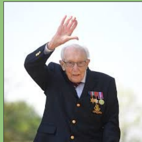
Sir Captain Tom Moore 30 April 1920 - 2 February 2021