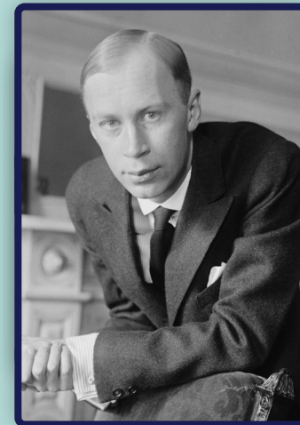
A Russian composer who wrote Peter and the Wolf