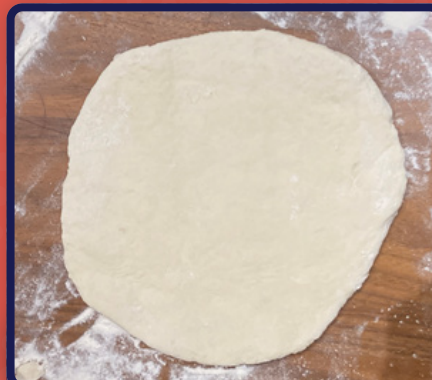
rolled pizza dough