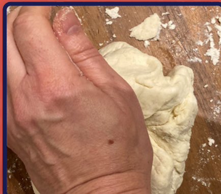
kneading the dough