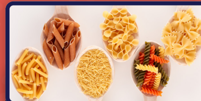
different pasta types