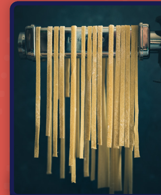
pasta hanging up to dry