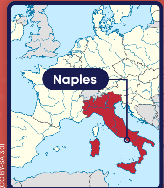
map showing Italy where pasta is very popular