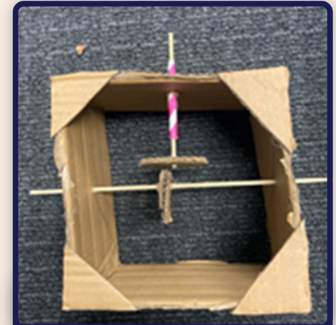
cams mechanism inside a cardboard structure