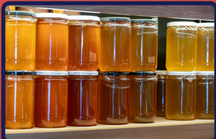
jars of honey