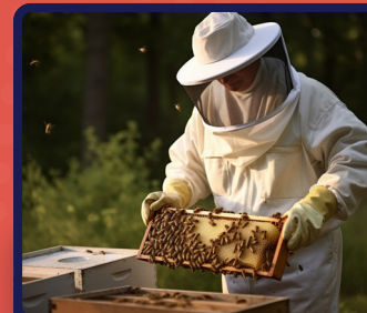
beekeeper in protective clothing