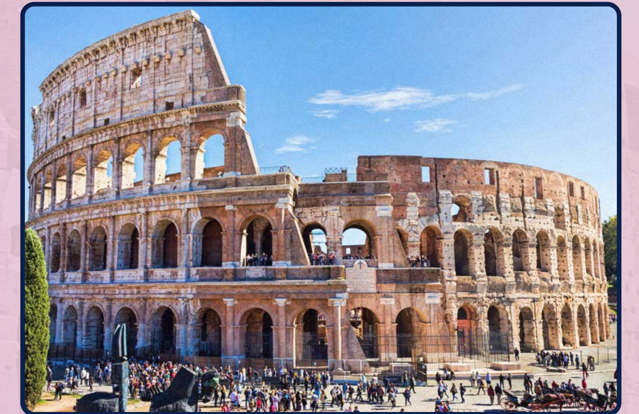
the Colosseum (80 CE)