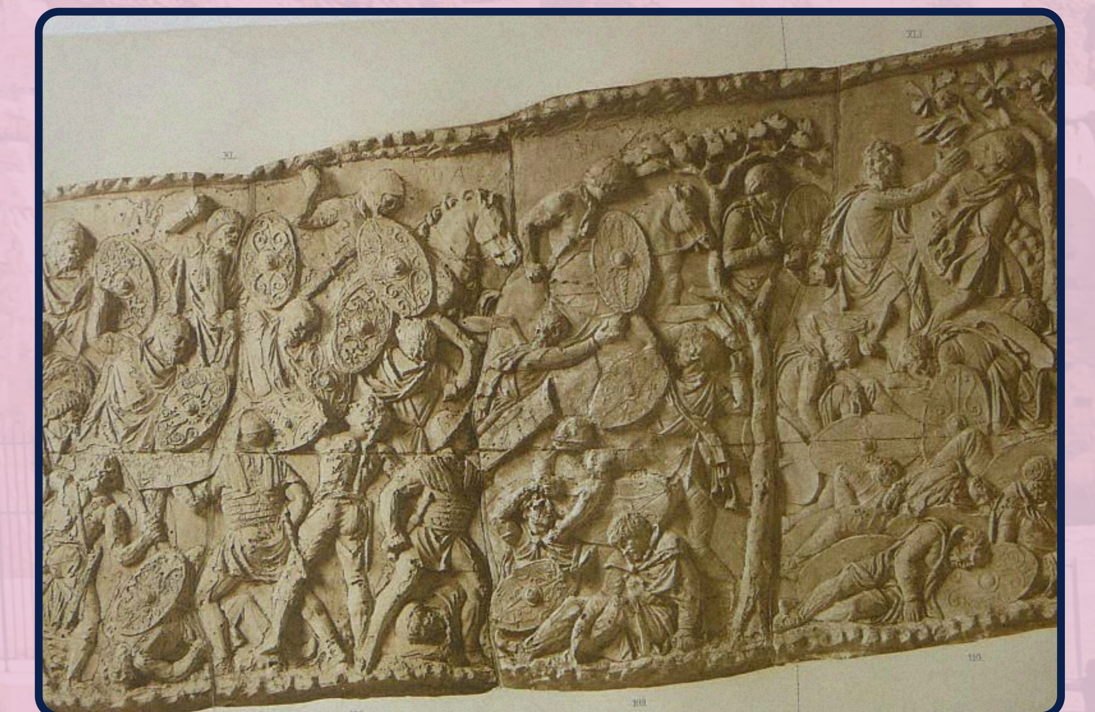
relief from Trajan's Column (113 CE) showing the Roman army