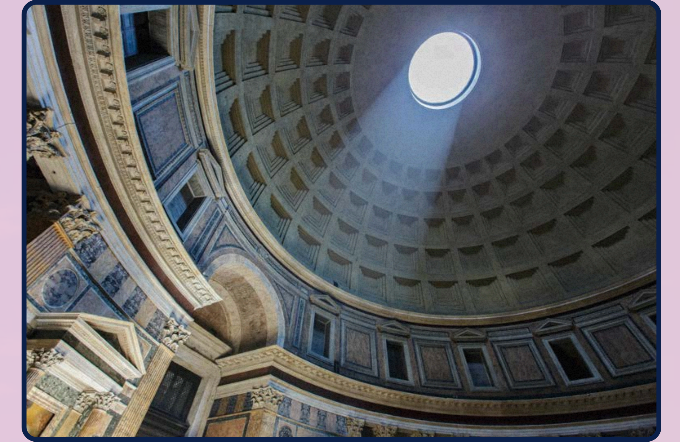
the Pantheon (126 CE)

a band of paintings or sculptures in relief