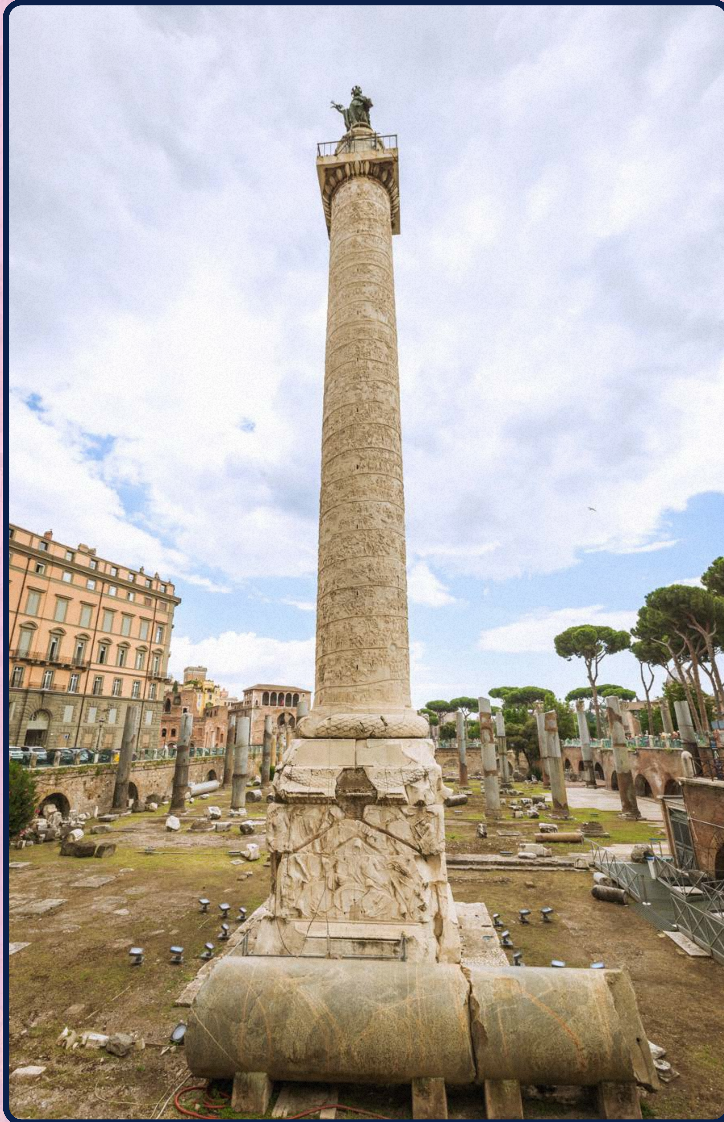
Trajan's Column (113 CE)