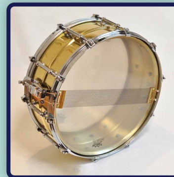
A snare drum (percussion instrument)