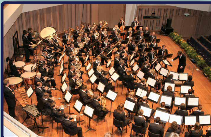
An orchestra of different instruments

The French composer who wrote Boléro based on the Spanish dance of the same name.