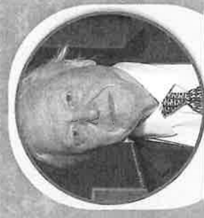
Sir David Attenborough a broadcaster and natural historian

most large plants reproduce by combining a male and female gamete (pollen and ovule) to make a fertilised egg that grows into an embryo, the embryo or baby plant is protected inside a seed