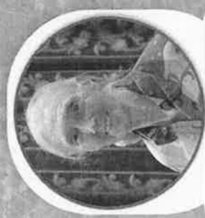
Dame Jane Goodall a primatologist and world expert on chimpanzees