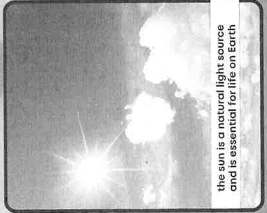
the sun is a natural light source and is essential for life on Earth

light bounces back from an object or material