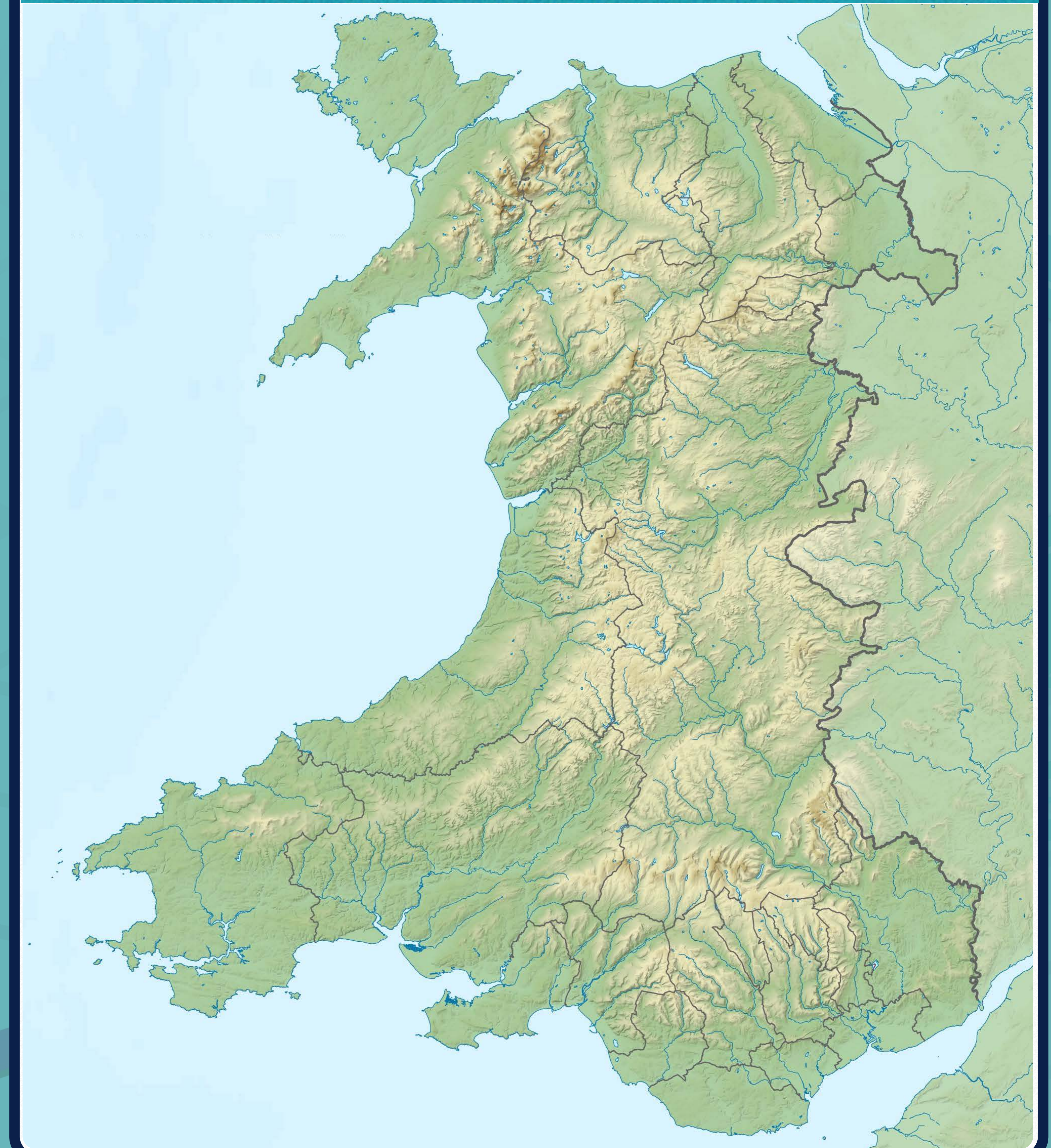
relief map of Wales

a map that uses shading and colours to indicate the height of the land